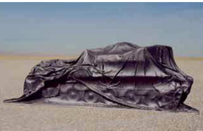
Dry Storage System