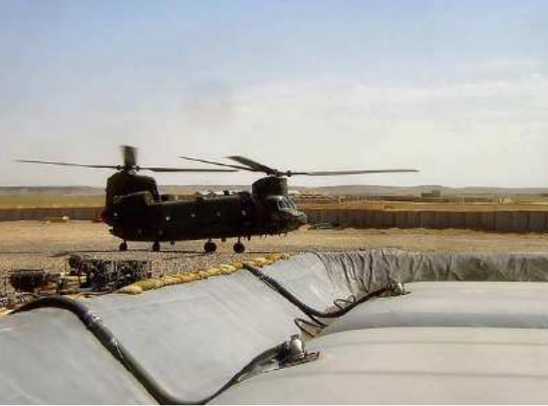
Fuel and Water Storage