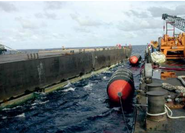
Low Pressure Fenders