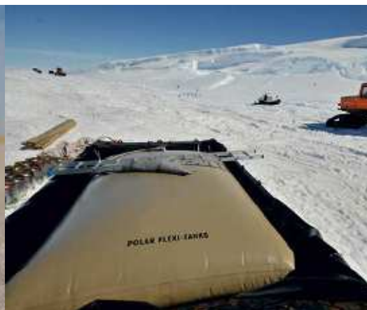
Fuel and Water Storage