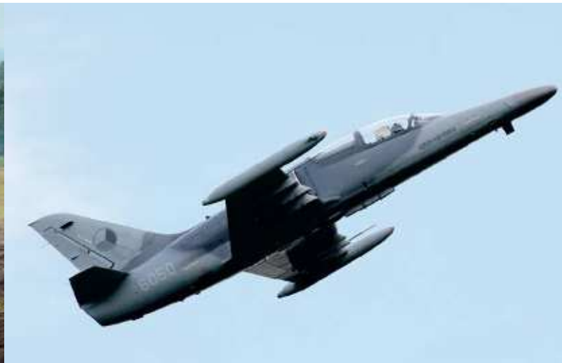
Aircraft fuel tanks