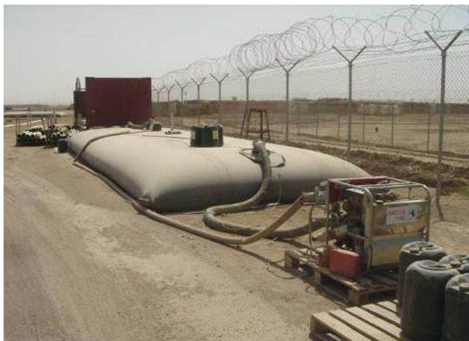
Large capacity fuel tank of up to 800,000 l volume

Rubena Náchod, s.r.o. Českých bratří 338 547 01 Náchod Telephone: +420 491 447 523 E-mail: bags@trelleborg.com www.rubena.eu