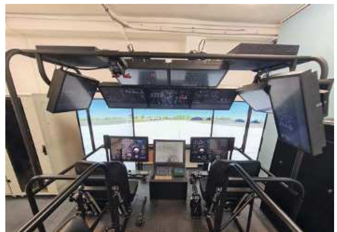
The simulators will contribute to the higher efficiency and safety of flight training of helicopter crews.