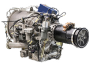
SAFIR 5K/G MIS