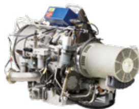
SAFIR 5K/G Z8