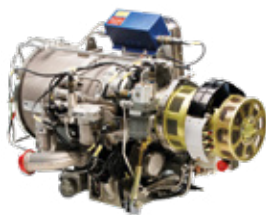
SAFIR 5K/G MI