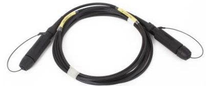
Tactical cable with HMA-J connectors

Note: 7) When PD (PoE powered device) ordered – no power supply cable required