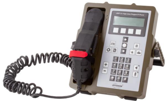
LMIPT-21 (RAL 6014)