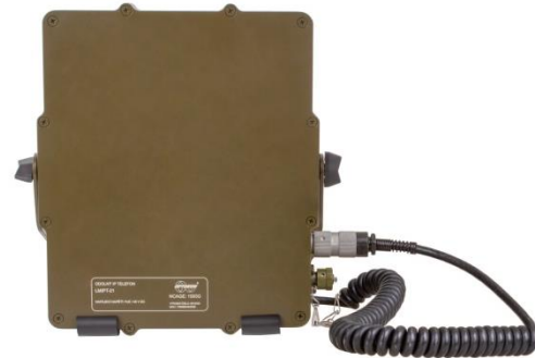
LMIPT-21 rear view