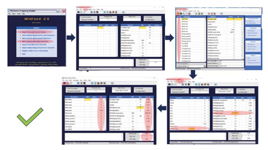
Fig. 1. Steps (see enlarged images in the database): Load/import feed store file + animal requirement file > go to feedstore (window) > select required ingredients (as per digestible lysine) or all ingredients > confirm and go to main window > set mandatory ingredient limits (min-max), check/set amino acid limits, set/loosen maximum protein, set bag size > click formulate (if an error message appears, loosen limits) > save.

This methodology presents a practical approach and links to available databases with the purpose, to scientifically assist to replace the fish derivatives in carp feed. Such practical guidelines and databases of alternative ingredients are not readily available to public knowledge. For commercial interests, these types of know-how and tools are almost certainly strictly confidential or subject to a charge. Therefore, the present methodology is expected to be of a considerable assistance to fish nutritionists, feed formulators, farmers and nutrition researchers. Especially small-scale farm managers preferring farm level feeds or small-scale feed manufacturers in Czechia and neighbouring countries may benefit from this methodology.