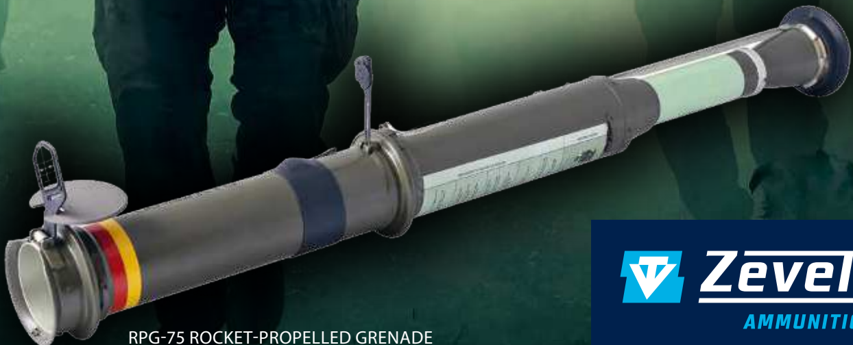
RPG-75 ROCKET-PROPELLED GRENADE