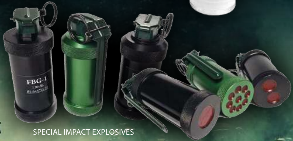
SPECIAL IMPACT EXPLOSIVES