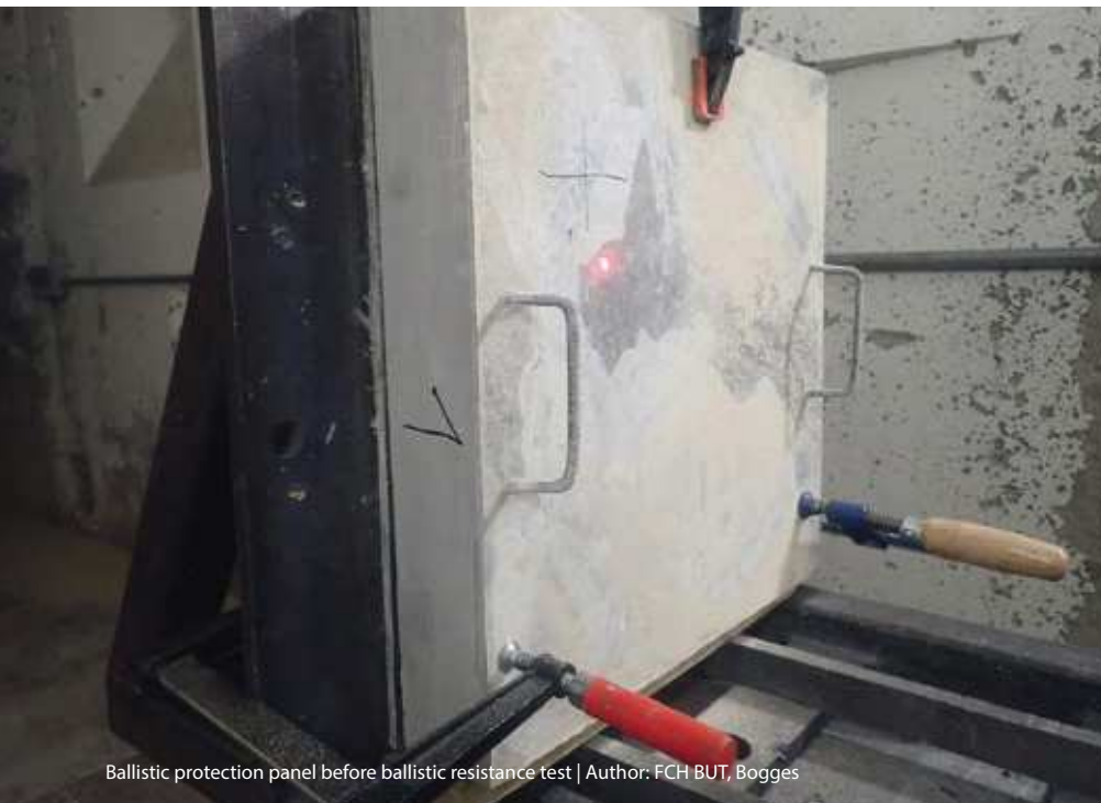
Ballistic protection panel before ballistic resistance test