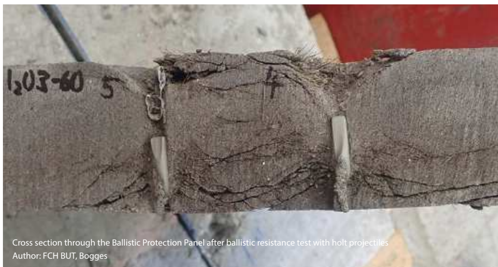
Cross section through the Ballistic Protection Panel after ballistic resistance test with holt projectiles

Since the other components of the mixture do not come from laboratory research and are commonly available on the market, the researchers managed to reduce the price of BOP to an acceptable level of about