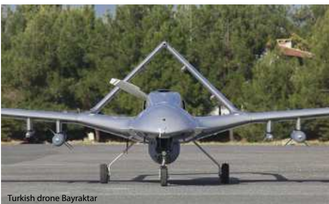
Turkish drone Bayraktar

It was quite obvious, and it is still evident today after two years of the War, that two schools collided. The Ukrainian one, being significantly influenced by the Western military school, and the still Soviet one, which did not accept the stormy technological progress. Although the Russians also had and have high-quality technologies, they did not know how to use it. It was the misunderstanding of the new role of drones that showed the inability of Russian commanders to view