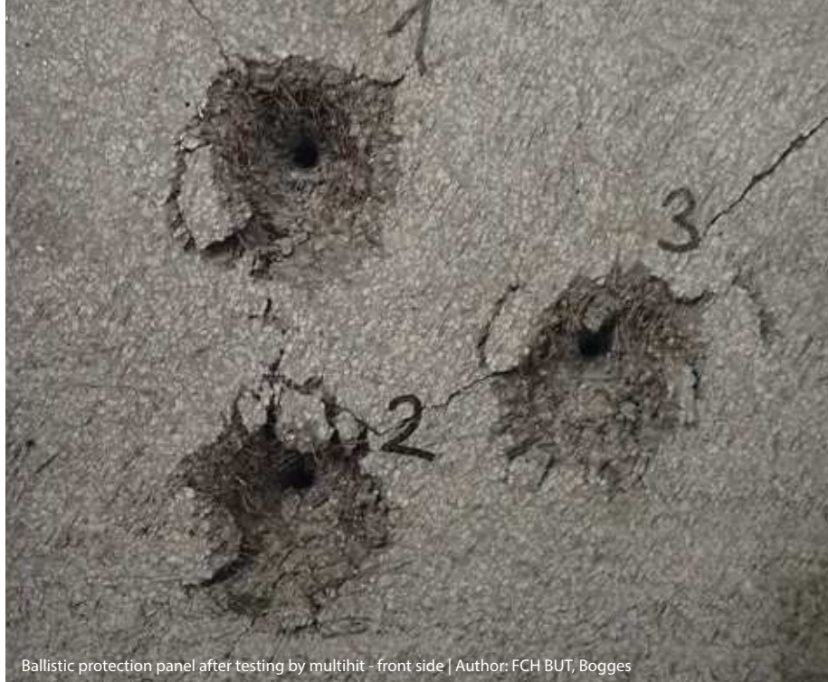
Ballistic protection panel after testing by multihit - front side

re reinforcement (Ultra High-Performance Fiber-Reinforced Concrete - UHPFRC) with increased ballistic resistance, together with the question of methodology for designing of concrete composition and testing."