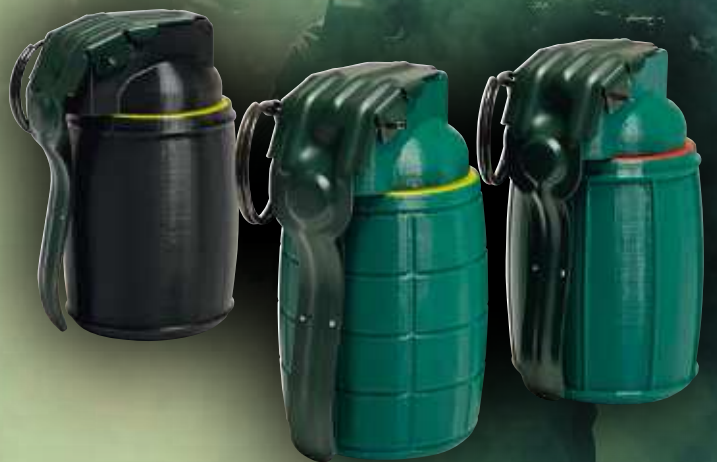
OFFENSIVE AND DEFENSIVE GRENADES - HG