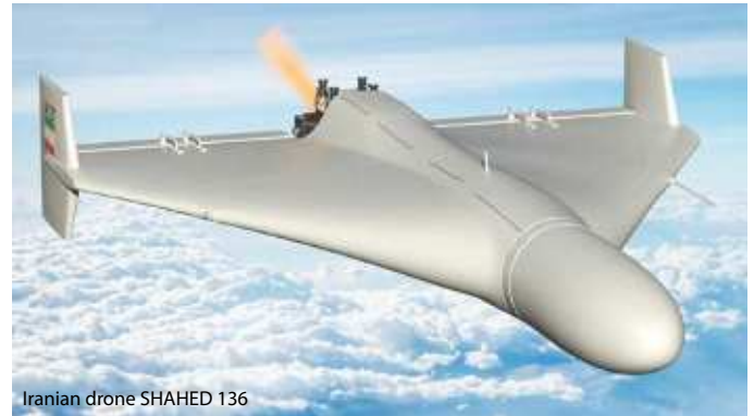
Iranian drone SHAHED 136

From the beginning of the War, it was obvious that unmanned